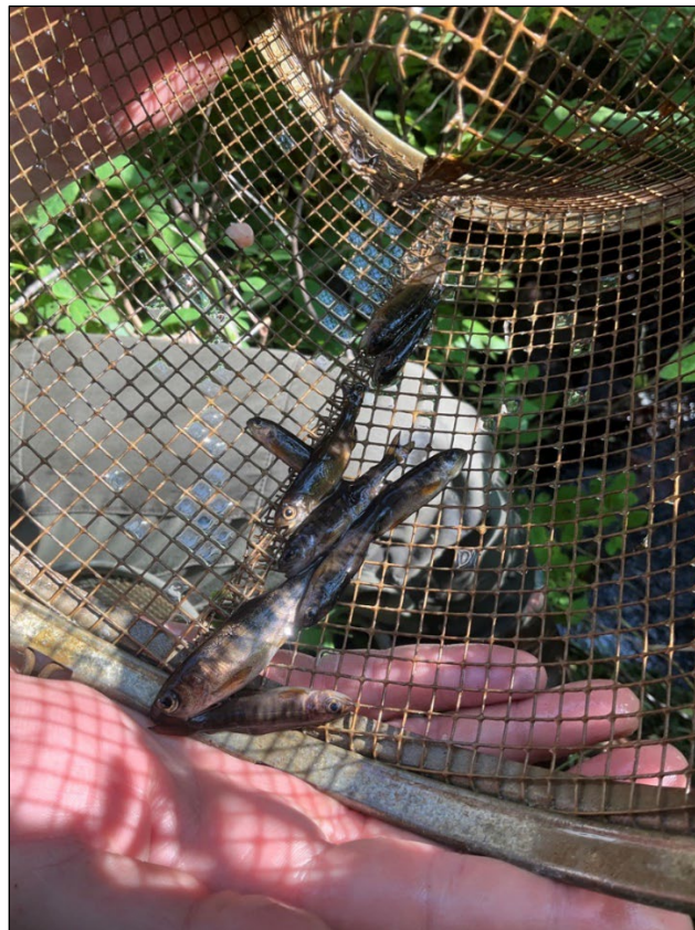
Figure 1.—Juvenile coho salmon captured at waypoint 699.