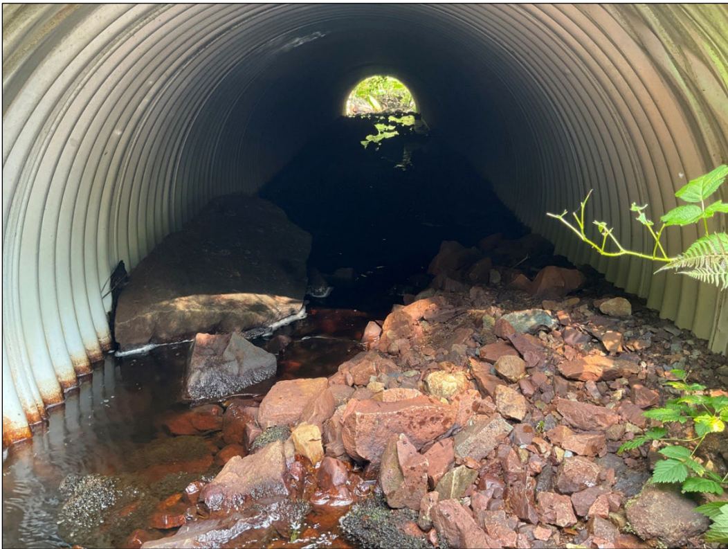
Figure 3.—Culvert at waypoint 786.