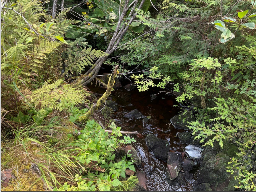
Figure 2.—Channel at waypoint 699, facing upstream.